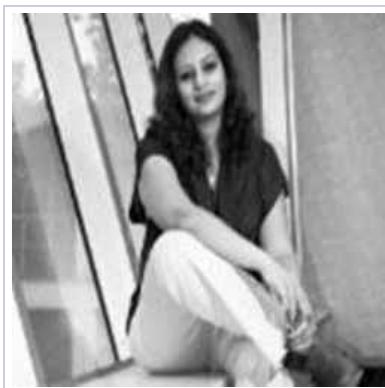
Click above to browse gallery